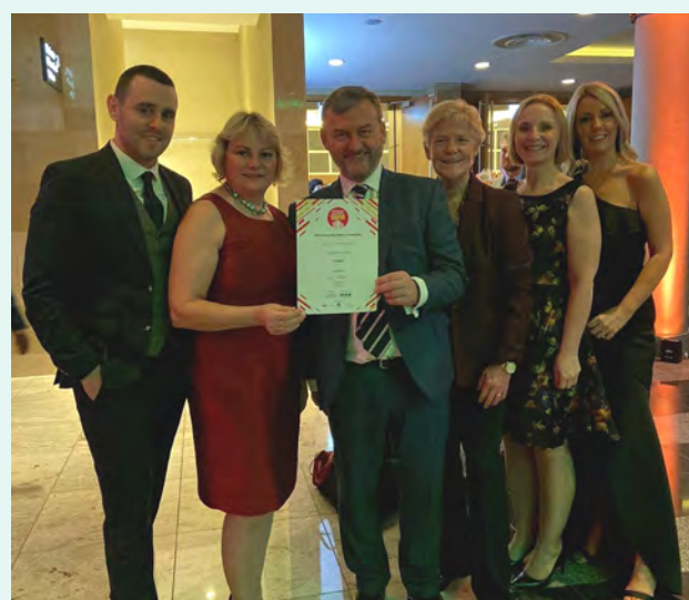
Highly commended for 'Best Partnership' at the Inside Housing Awards 2019