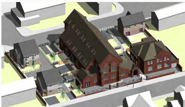
Original Plan of St Bernards, aerial 3D View

"The team at Ainsley Gommon Architects is delighted to have been able to work with HPBC, Onward Homes, Hampton Developments NW and many other organisations