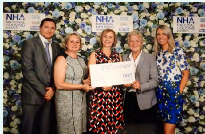
Receiving 'Best Partnership' Award at the NHA 2019

"It's small scale for sure, but the sweat equity is a fantastic opportunity. Ideal for people who are