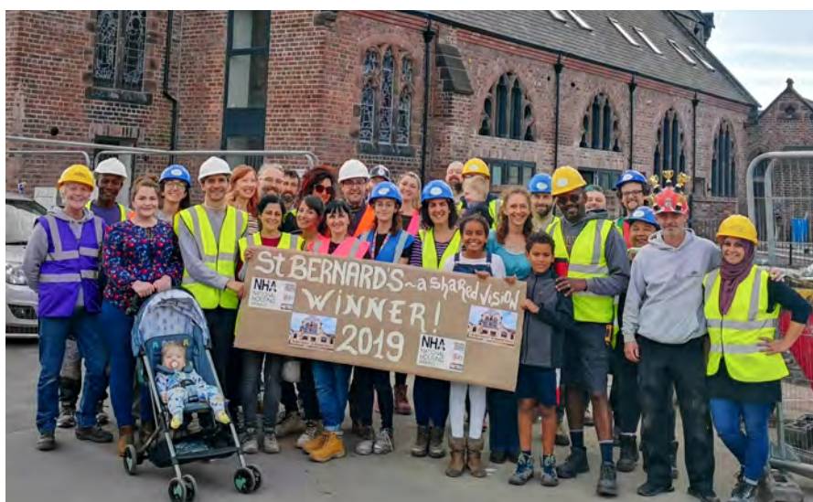
Home Partners celebrate HPBC and Onward winning Best Partnership Award at NHAs 2019

Completion of the St Bernard's scheme represents nearly 20 years of HPBC building communities in Granby, L8.