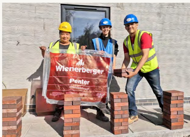
Home partners working with donated block paving